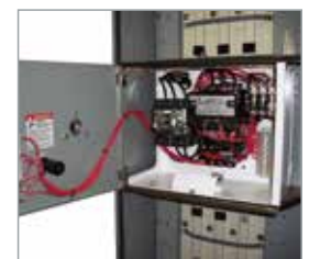
Square D replacement MCC unit installed in General Electric 7700 Series structure

For both the direct replacement and retrofill modernization solutions, new cubicle doors are provided to match the existing equipment and new circuit breaker face.