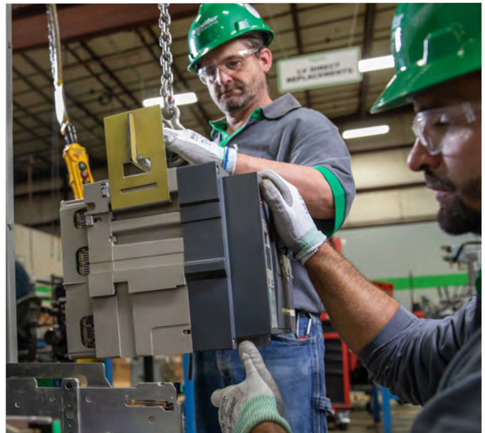
Equipment is de-energized

Both the direct replacement and retrofill solutions feature new cubicle doors to match the existing equipment and new circuit breaker face.