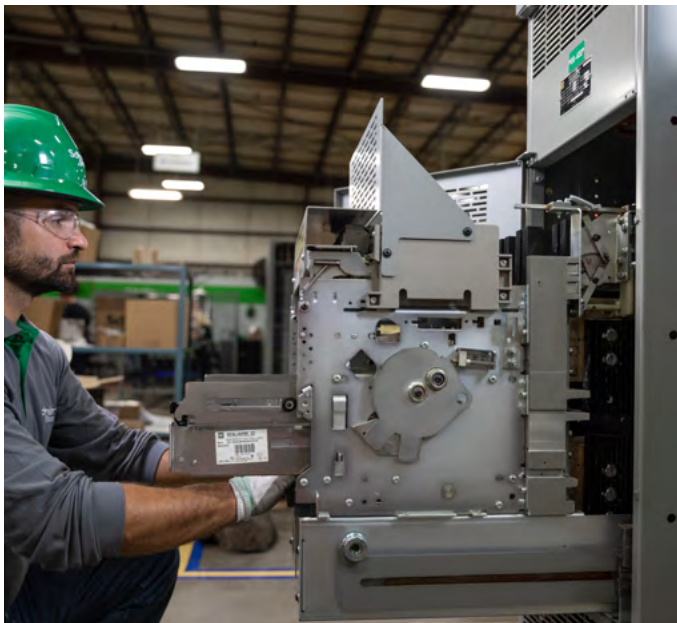
Equipment is de-energized