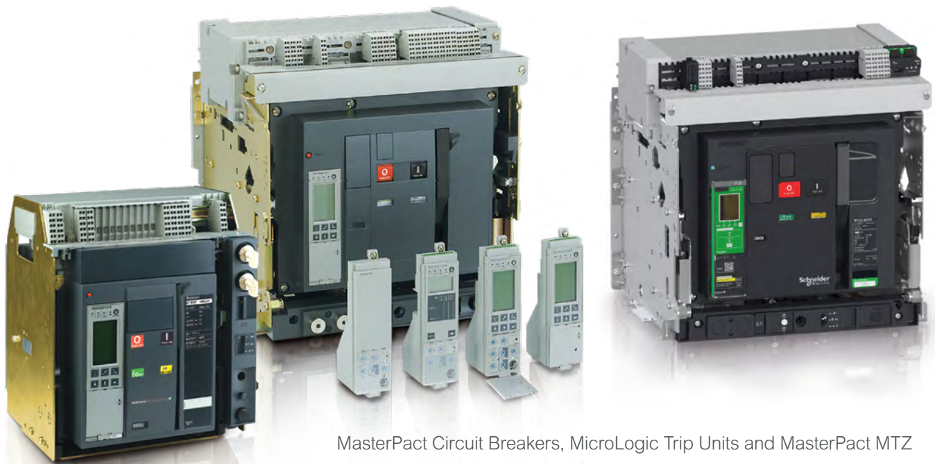
MasterPact Circuit Breakers, MicroLogic Trip Units and MasterPact MTZ